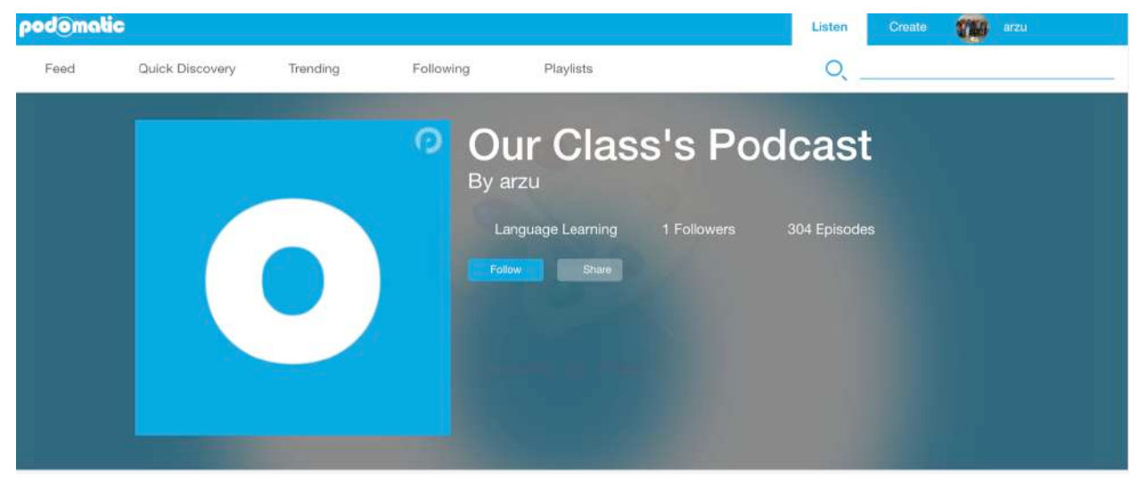
Figure 1. The class podcast page designed for the study

In addition, a pre-test was administered by the participants to get information about students' level of speaking abilities. BTCE (The British Test Centre for English) exam was used to test learners' English speaking skills. The pre-test exam was carried out for a week and it took nearly ten hours. During the pre-test, forty students were tested. Both in pre-and post speaking tests, students' performance was assessed according to BTCE exam rubric including 9-band scoring system (shown in Appendix III). In addition, students were video recorded during the speaking tests